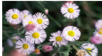
Brings May Flowers

May 19-25, Baptist Association Emphasis Week